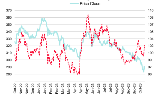
Siam Cement (SCC TB)